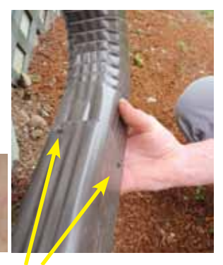
Place screws only on the top or side of the gutter.