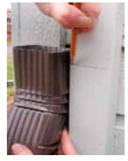
Mark the connected downspout one inch below where the elbow/extension assembly lines up with it. This is where you will cut.