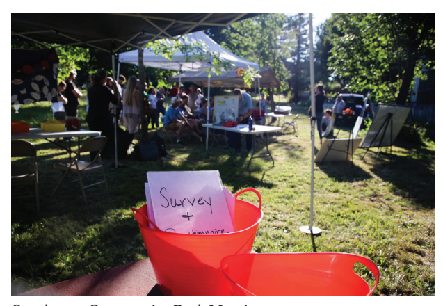
Southwest Community Park Meeting