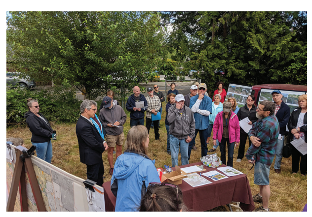
Southeast Neighborhood Park Meeting