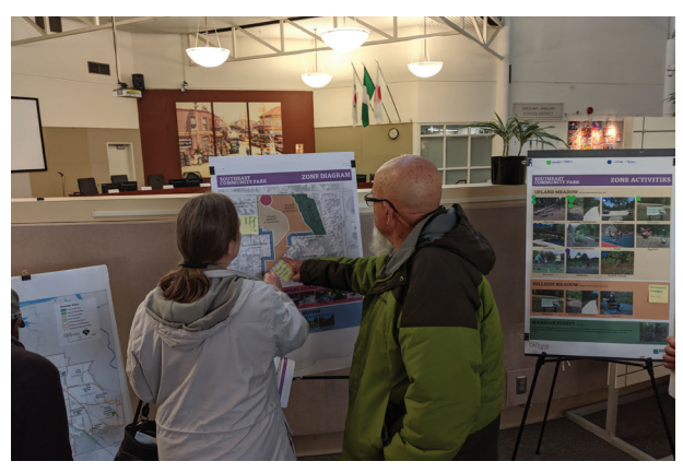
East Side Open House Meeting