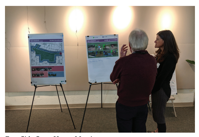
East Side Open House Meeting