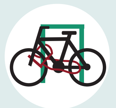
LOCK UP SMART

2017 City of Gresham Bicycling Map & Guide