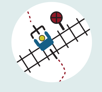
CROSS ALL TRACKS AT A RIGHT ANGLE

Bicyclists and passengers under 16 are required to wear a helmet.