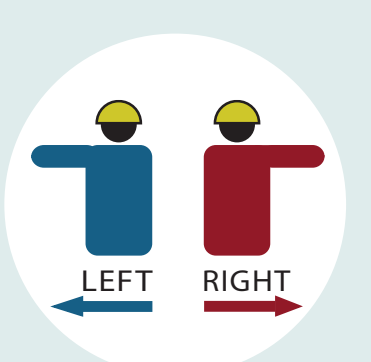
USE HAND SIGNALS