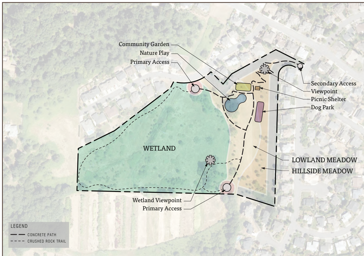
Jenne Butte Neighborhood Park - Concept Plan

Based on analysis of the unique existing conditions and feedback on the zones diagram during public engagement meetings, the following concept plan was developed.