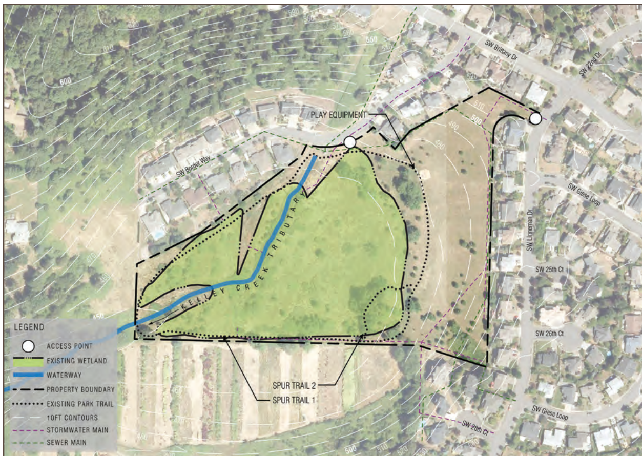
Existing Conditions Plan

Currently one set of swings exist, as well as a bench. There are two access points to the park. Members of the community use the park for playing with dogs, trail walking, and wildlife watching. There is one viewpoint at the top of the hill in the Northeastern corner of the park over the wetland and to the surrounding caldera.