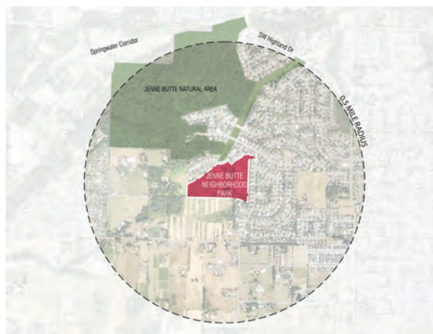
Adjacent Properties Map