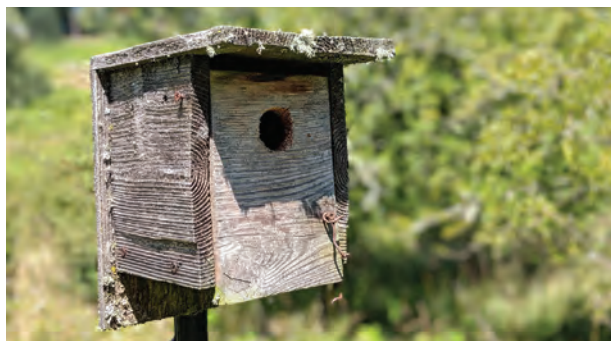
Wetland Bird Box